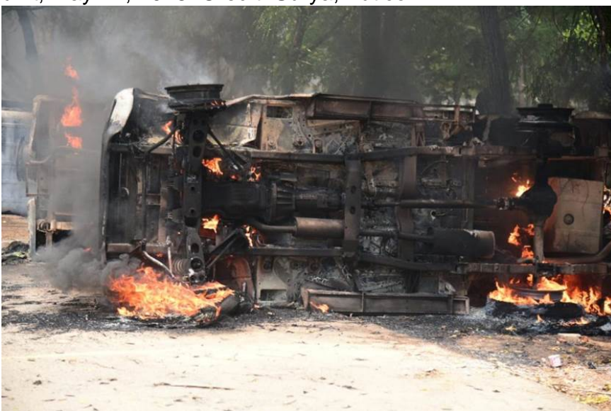
Scenes of protest for the 100th consecutive day in Thoothukudi against the Sterlite unit, May 22, 2018.