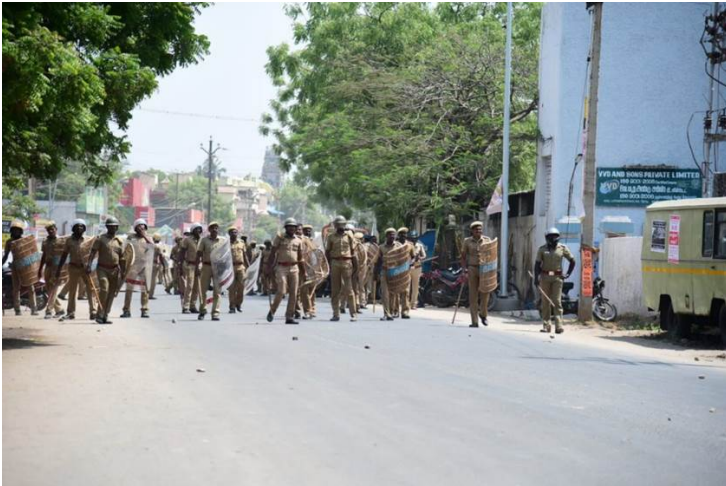
Scenes of protest for the 100th consecutive day in Thoothukudi against the Sterlite unit, May 22, 2018.