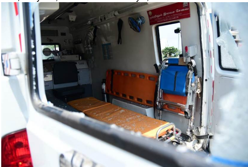
Scenes of protest for the 100th consecutive day in Thoothukudi against the Sterlite unit, May 22, 2018.