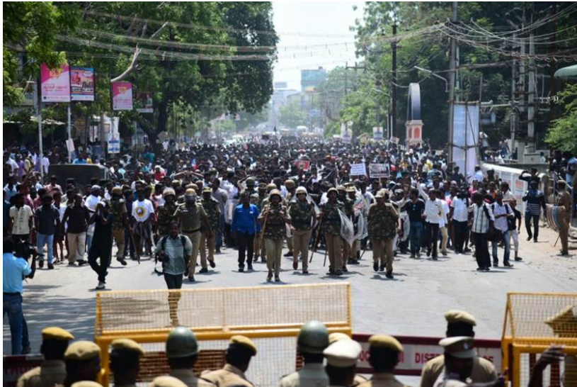
Scenes of protest for the 100th consecutive day in Thoothukudi against the Sterlite unit, May 22, 2018.