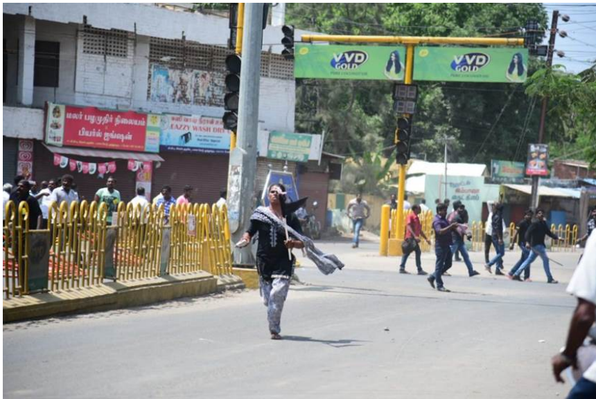
Scenes of protest for the 100th consecutive day in Thoothukudi against the Sterlite unit, May 22, 2018.