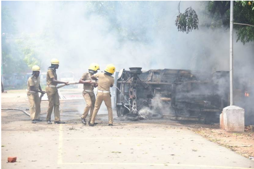
Scenes of protest for the 100th consecutive day in Thoothukudi against the Sterlite unit, May 22, 2018.