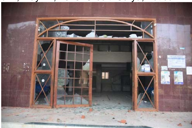
Scenes of protest for the 100th consecutive day in Thoothukudi against the Sterlite unit, May 22, 2018.

https://thewire.in/environment/anti-sterlite-protest