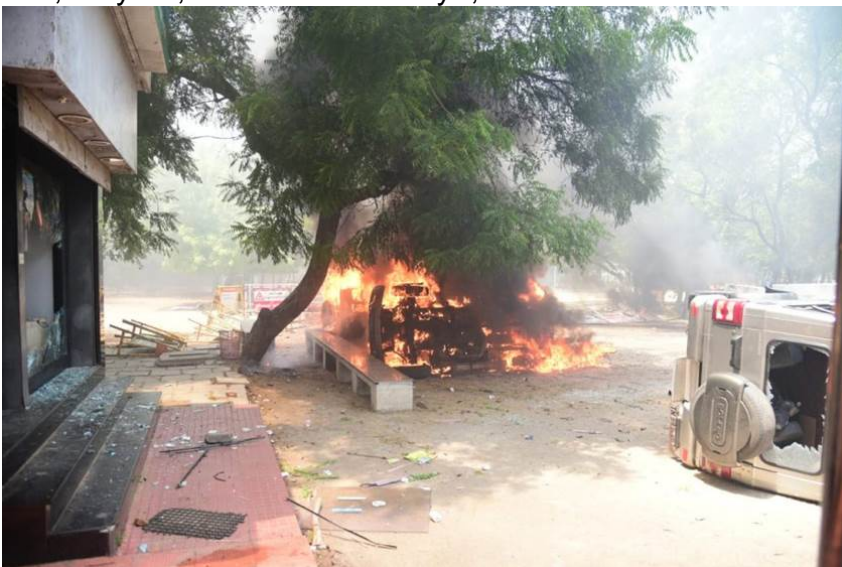
Scenes of protest for the 100th consecutive day in Thoothukudi against the Sterlite unit, May 22, 2018.