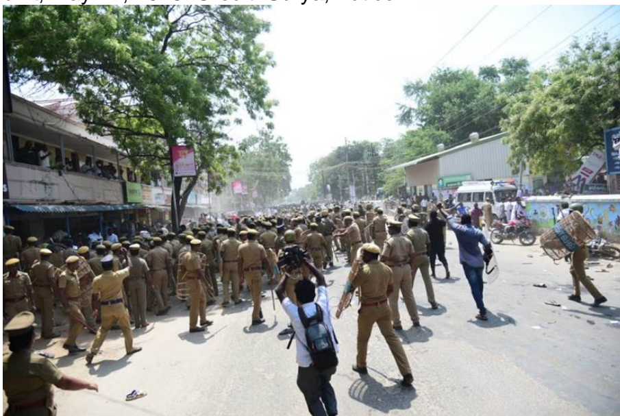
Scenes of protest for the 100th consecutive day in Thoothukudi against the Sterlite unit, May 22, 2018.